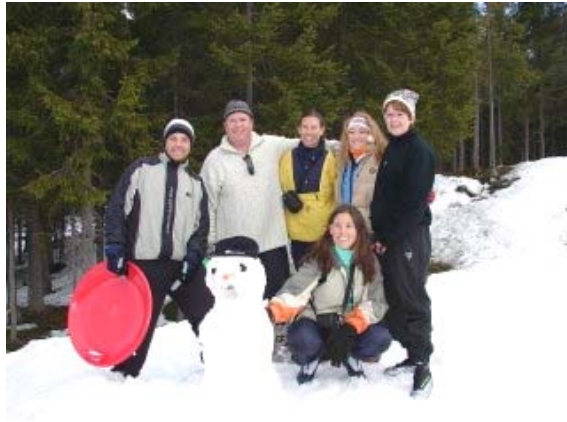
Building a snowman on the ski slopes!