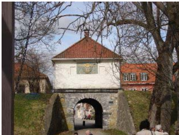
The fortified town of Fredrikstad—1500's